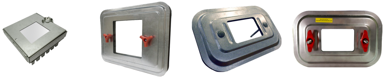
Basic Viewport Access Door

- Aaron Engel, VP For Business Development Fresh-Air UV